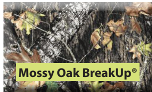
Mossy Oak BreakUp®