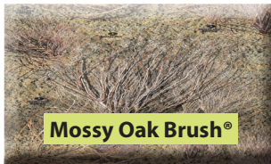
Mossy Oak Brush®