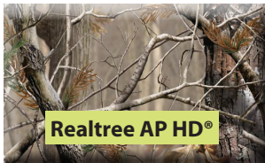
Realtree AP HD®